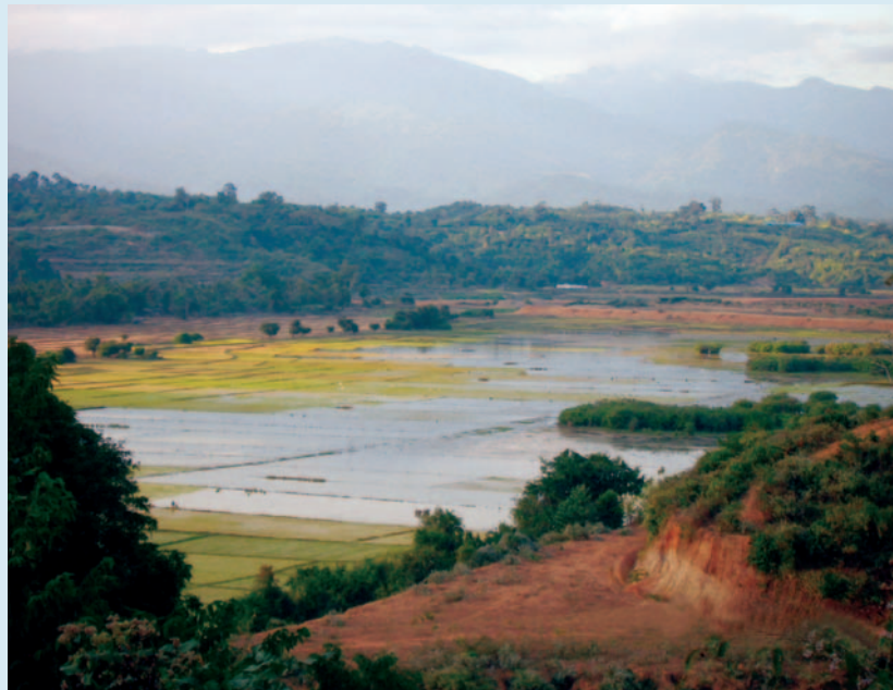
Changkong lei ho jong segam ding ahi tai.

Dam akitin khel khel chu vadung twi lounding dan chu hetthei ahi tpoi. Twi hah phat hung um jing in tin vapang a lou kibol ho mi touna kong le kitol na kong ho dinga thilboi umtah hiding twi hungtam vang vei, hiti hohin mihim angai a athil bolhou hatah a asuh boi ding ahi.